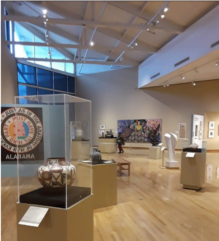
Left: an exhibit in the Miami University Art Museum

Excellent cultural resources include the Oxford Community Arts Center (with classes, exhibits, and performances), the fully accredited Miami University Art Museum , the Lane Public Library and Smith Library of Regional History in addition to the Miami University Library system, and the University's lecture series. A wide variety of on- and off-campus concert and dramatic performances are promoted by Enjoy Oxford and the University through departmental and institutional calendars and announcements.